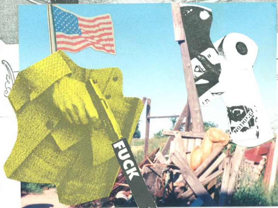
20th Anniversary Edition of the 80s most Blasphemous Text